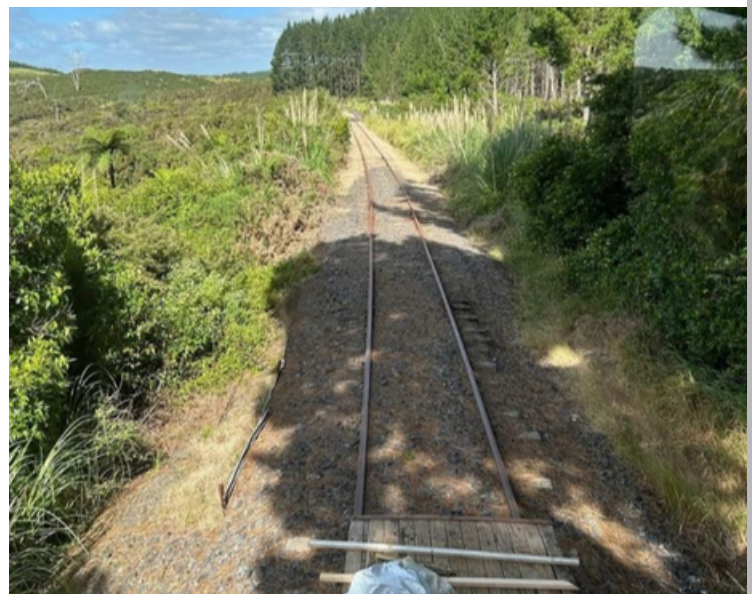
Left: track issues after the recent events (P. Cairncross). Right: a clear view of the line, with the challenges of keeping the vegetation under control! (C. Mann)