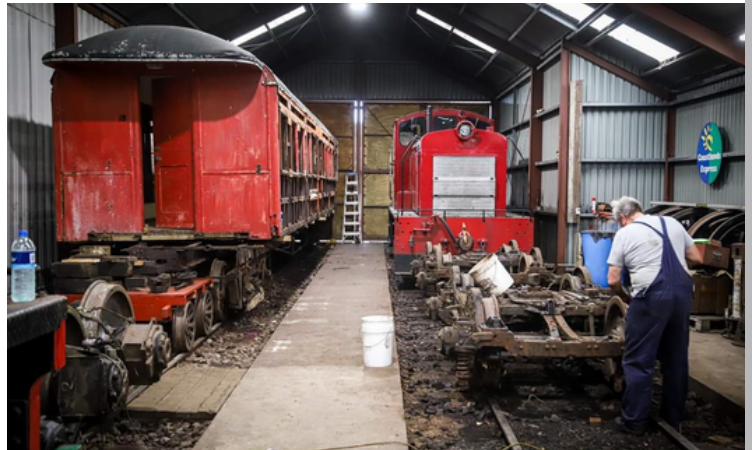
Left: 398 - one of the reasons for the shuffle is to enable the Flying 15 Team access to the cylinders and valves on the firemans side. Right: Aa1670 checking out its new X25140 feet as Peter N makes a start on dismantling.