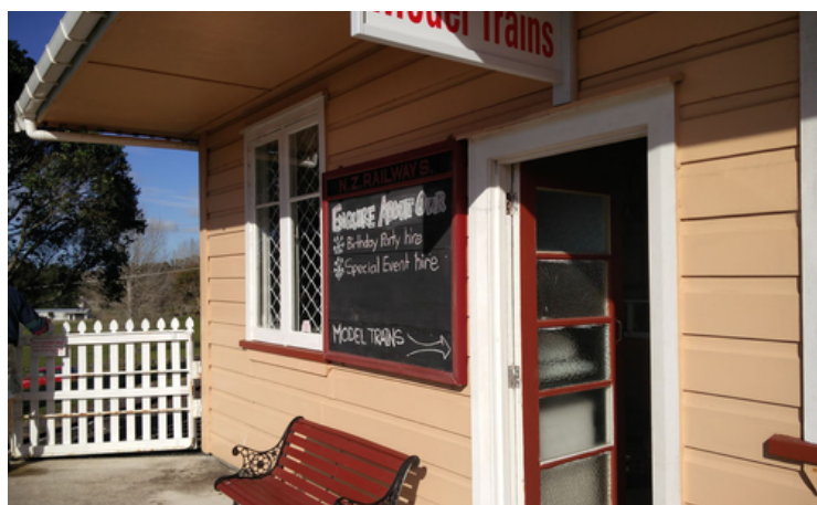
Photos: Left: Whangarei Railway Station - nzherald.co.nz. Right - Whangarei Steam and Model Railway Club - steamnorth.co.nz