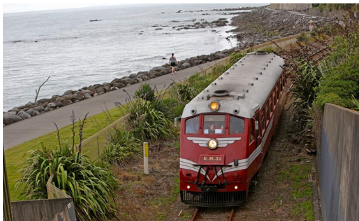
Left: RM 31 near Inglewood under Mount Taranaki (Egmont). Right: Approaching Puke Ariki.