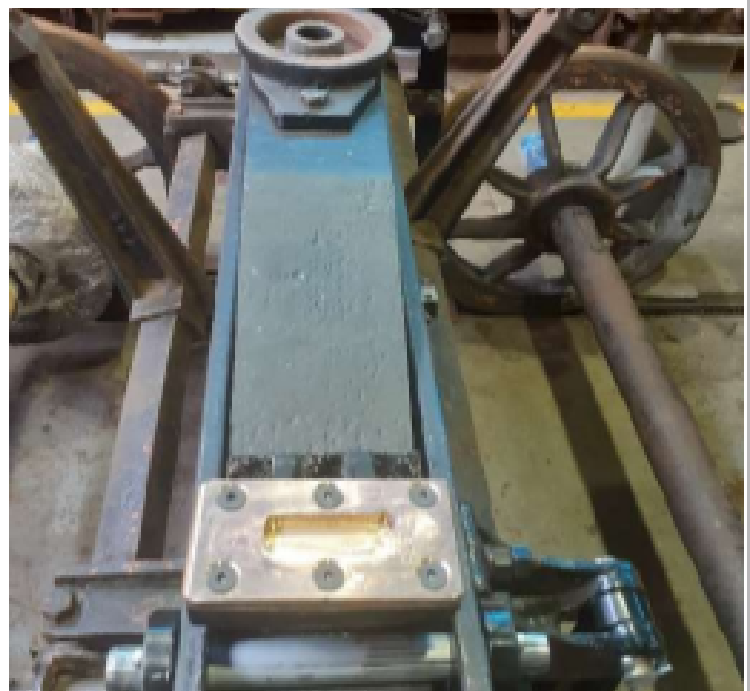
Left: Chafing block with bronze packer. Right: The chafing blocks fitted to the trucks