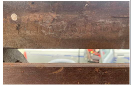
Left: EA3298. Middle: C100, right: Horsnell found on the window framing.