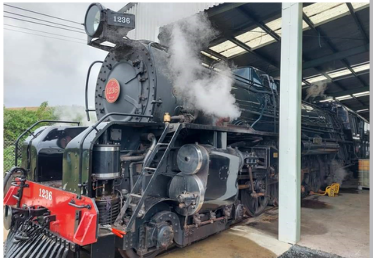
Left: Ao48 painted with the Mainline Steam decals in place. Right: Jb1236 in steam to test the pumps.