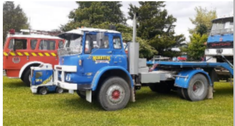
Left: The tractor convoy stopped in Albury for a quick break. Right: trucks from the Classic Truck museum on display after the parade.