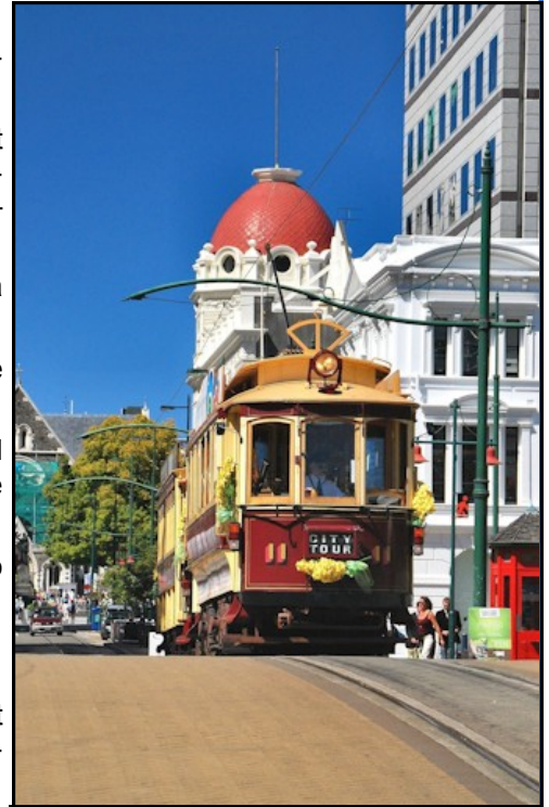
How it was. Christchurch Tramways No 11 (the Boxcar) , 1903 vintage from former Dunedin Corporation, pauses on Worcester Boulevard bridge with Dome of the since demolished Regent Theatre building in background.