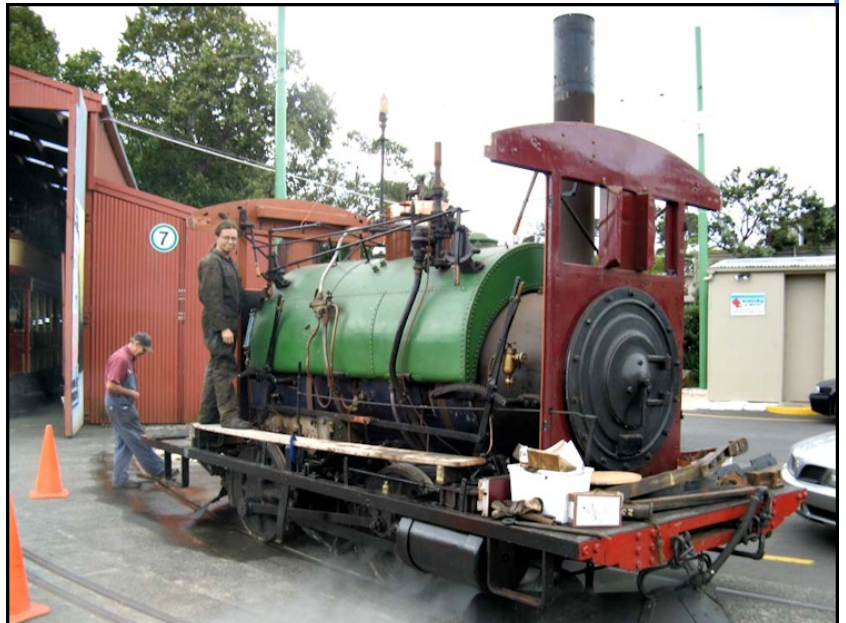
David Robb cracks the throttle on MOTAT Baldwin steam tram 100 on April 1 as it moves under its own steam first the first time since Labour weekend 2009. In the intervening period it has undergone a complete overhaul of the underframe, and other work.