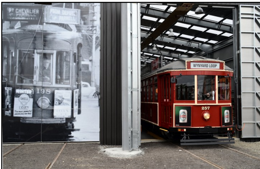
DL05, Auckland's Dockline Tram barn. Former Melbourne X1 257 and a door featuring photo mural from Graham Stewart.

And, in the meantime, Christchurch Tramway was contracted to supply trams for and operate Auckland's 1.5 km Wynyard Quarter tramway, Dockline Tram, which opened in August 2011. The trams sourced were an ex-Melbourne X1 and a W2 class, presented in former Auckland Tramway livery.