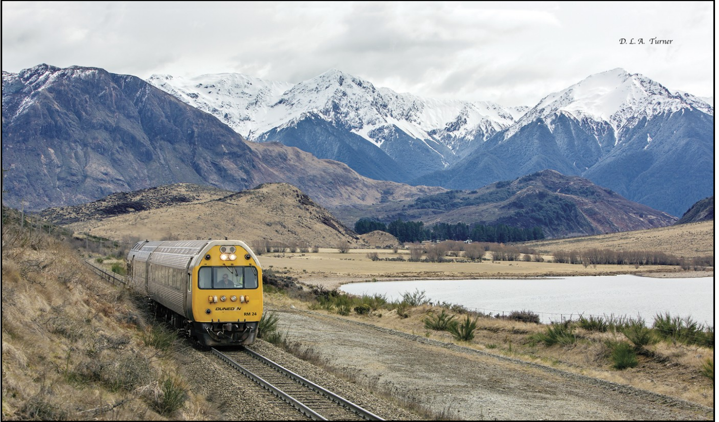
These three images of the Dunedin Railways Silver Fern from D.L.A. Turner on Friday 11 September 2015 were taken on the Cass Bank, Lake Sarah on the right of the top image, with the Southern Alps behind.