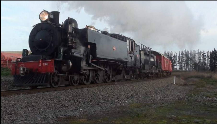
Wab794 rounding Milson Junction with a Feilding and District Steam Rail Society train to Masterton 17 July.