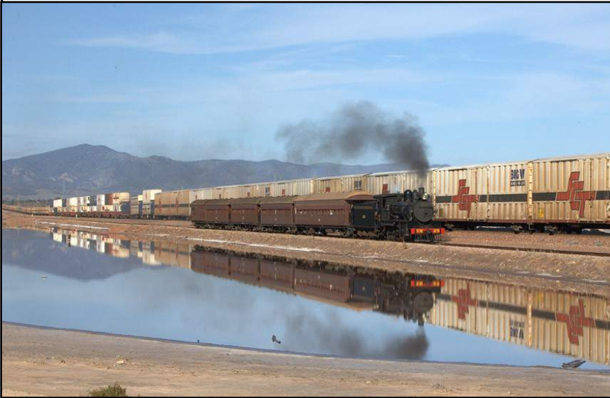
Spring 2016.

Tim reminded us that the Australia our East West Transcontinental Railway Centenary is 17 October 2017. Further investigation found the following information on the website http://www.rdawep.org.au/trans-australian-railway-centenary/ .