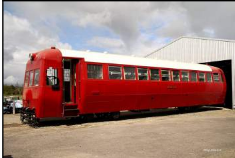
Below: Pahiatua railcar Society RM 31 and Waitara Railway Preservation Society DSC 2584 with its consist, pass each other at about 196.5 km post on the Marton–New Plymouth line, north of old Lepperton station and Yard.

Unfortunately, due to technical issues, PRS have had to cancel the events that were scheduled to take place on 4 February 2018 for the relaunch of RM5 Mahuhu.