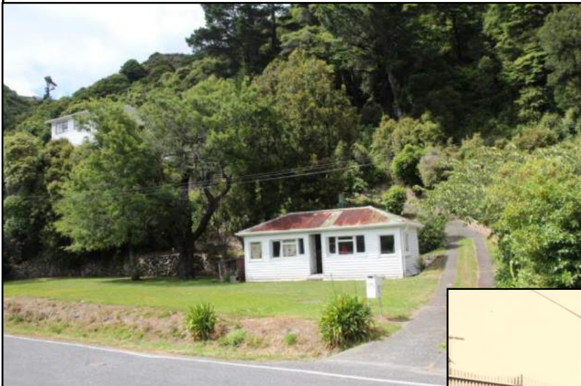
Above No. 86 at Te Marua, north of Upper Hutt.

Conservation of the body and chassis of Wellington's combination tram No.17 has reached an advanced stage at The Wheelwright Shop, Gladstone, Wairarapa. It is due back at the Museum for Easter 2018.