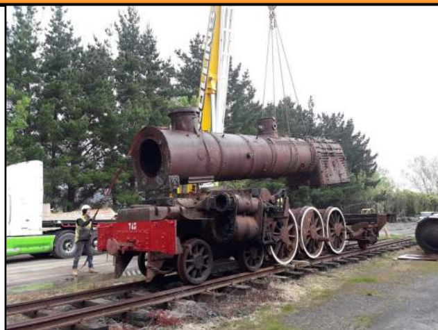
Replacement boiler for Ab745. The Trust purchased the boiler from NZRLS as-is-where is at Feilding earlier in 2017.

We operate trains at Maymorn on the second Sunday of each month, 10am-4pm.