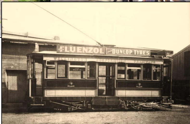
Above: An official photograph of tram No.44 or 45 in its final form – similar to No.86.