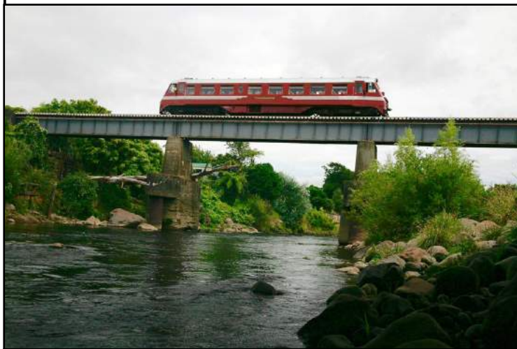
Left: Crossing the Waiwhakaiho River shot from water level. James Heremaia.

RM31 had a successful run to New Plymouth and back over the weekend of 21, 22 January with local shuttles from New Plymouth to Lepperton and Inglewood. A very successful weekend although one local attraction, a certain mountain, kept itself hidden behind the clouds.