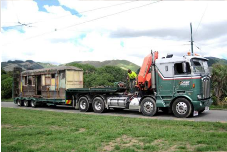
Left. Tram 86 arrives from its previous location as a sleep-out in Te Marua. 23 February.