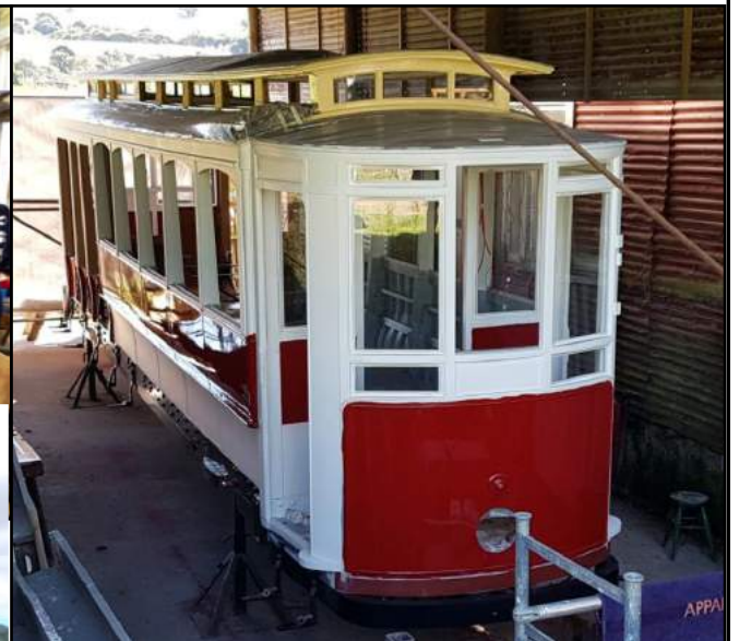
Above: Tram 17 at Gladstone, 26 March. Roof canvasing complete. Exterior paint undercoats being applied.