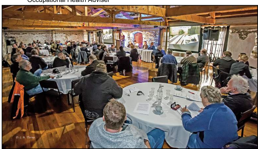
Attentive members at the AGM in the historic Landing Conference Centre, Timaru.