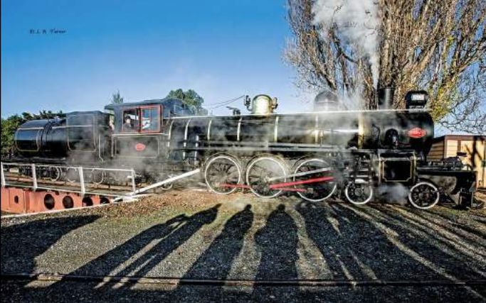
Above: Photographed by a gallery of conference attendees, Josh Granger drives the now just-turned Ab off the turntable at Keanes Crossing. The turntable was originally built early in the 20th century and located at Cromwell, the terminus of the former railway into Central Otago

Below. Overseen by Station Master Lloyd Robertson, Ab 699, lit by low-angle winter evening light, propelled a train of vintage wooden stock away from the museum station at Pleasant Point to the Keanes Crossing end of their railway that runs along the formation of the former branch line to Fairlie.