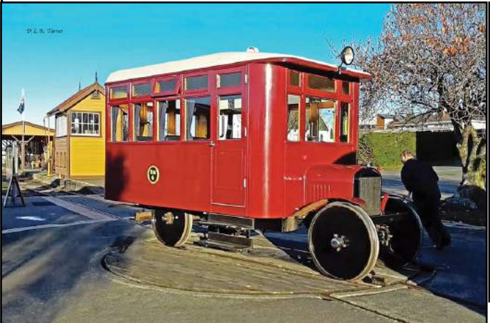
Above: Railcar driver Les Coombes was turning RM 4 on the wagon turntable located at the end of the museum's railway in Pleasant Point.