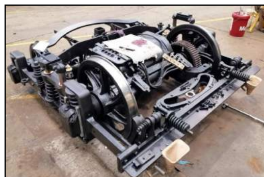
Above: One of the two Brill type 22E trucks at A&G Price Ltd. 22nd July 2019.