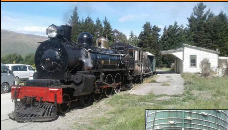
Left: AB795 at Fairlight, 30th November 2019. This was a test run following track work and mechanical work to 795. Right: Kingston loco yard the following day.

The focus is now on restoration of the carriages. Neville Simpson.