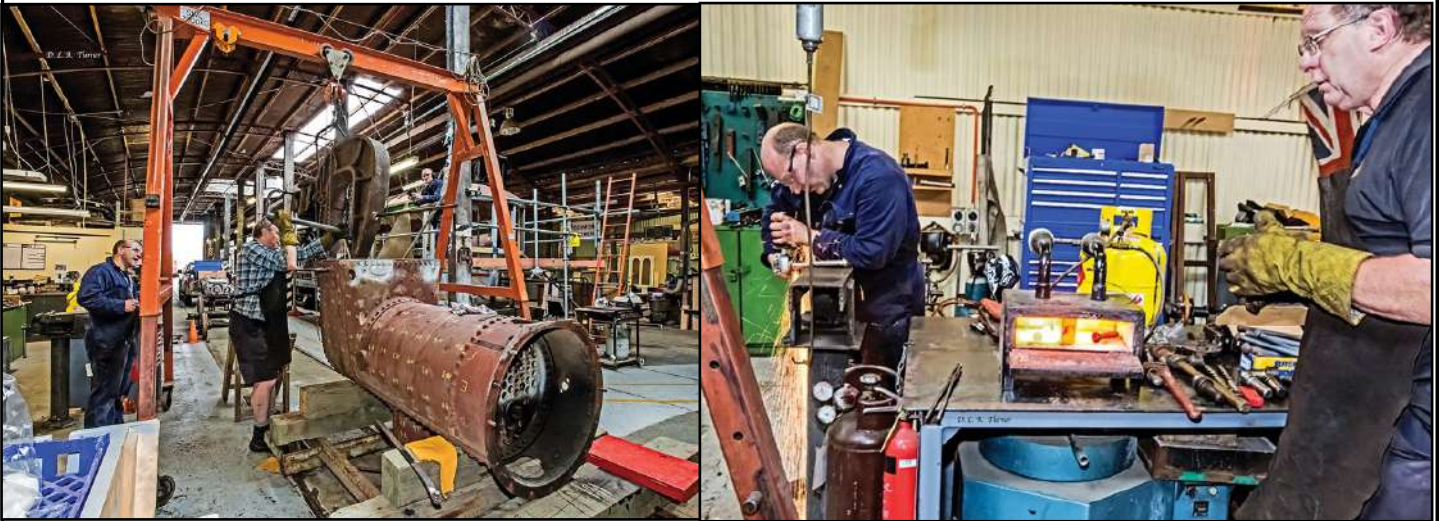
Above left: Gap Riveting Kitty's Replacement Boiler. Removing a temporary fastening bolt, a length of pipe providing the necessary extra leverage.