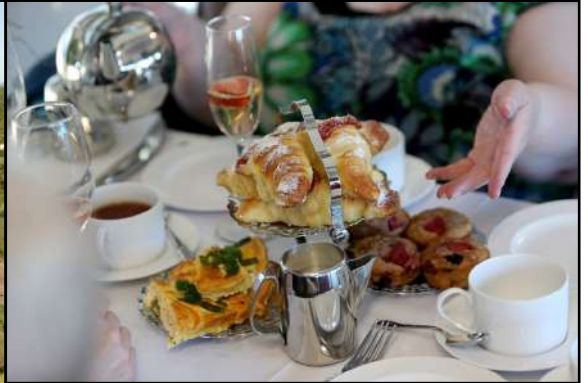
Left: Forest Lakes. Above: Fine dining for some of our guests.