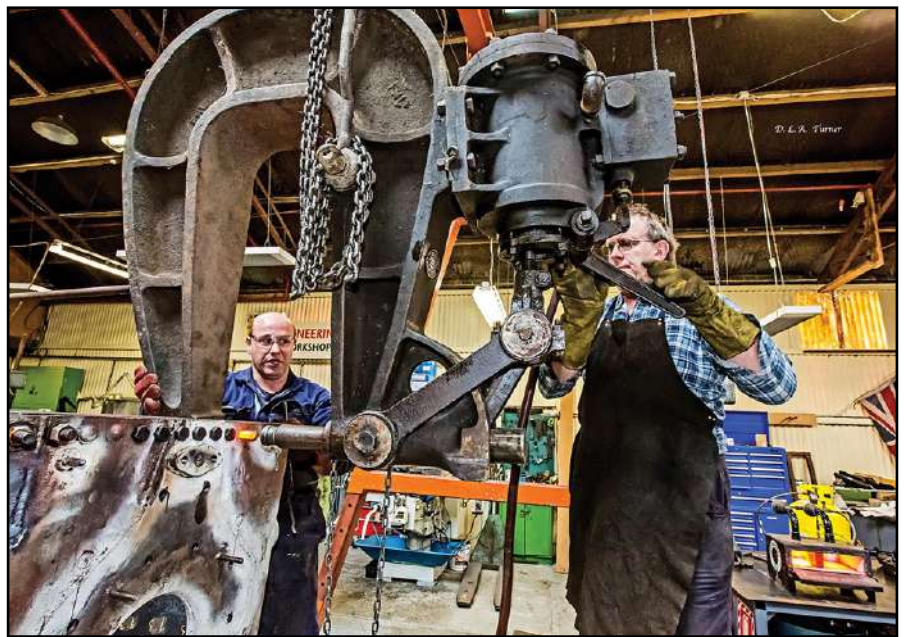
The molten rivet, heated in the adjacent Porta Forge, is used to replace a temporary fastening bolt.