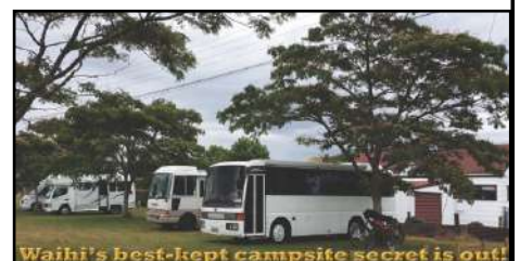
Waihi's best-kept campsite secret is out!