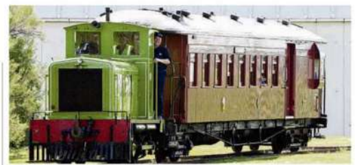
Christmas trains . . . The Ocean Beach Railway will operate its first Christmas-themed train this Sunday, raising funds and gathering food for local food banks.