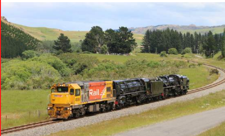
Going through the Hurunui Gorge.