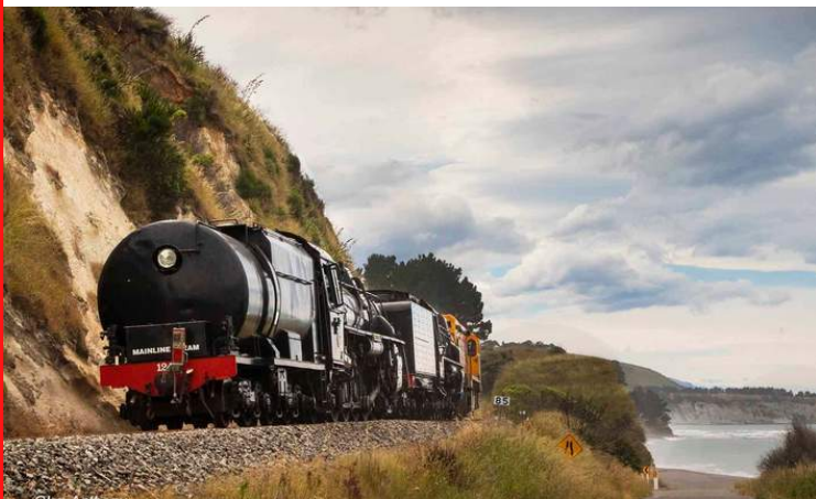
Heading towards the Kaikoura Coast.