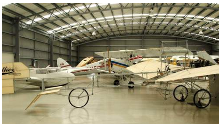
Croydon Aviation Heritage Centre.