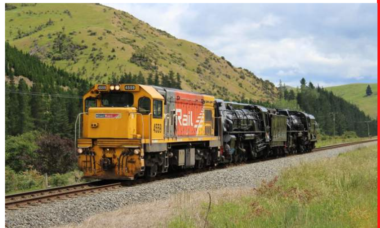
DCP4559 leading the set out of the Ethelton Gorge.