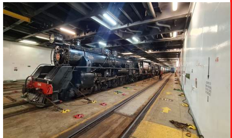
Secured on the ferry.