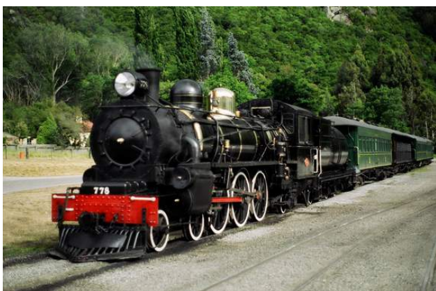
The Kingston Flyer.