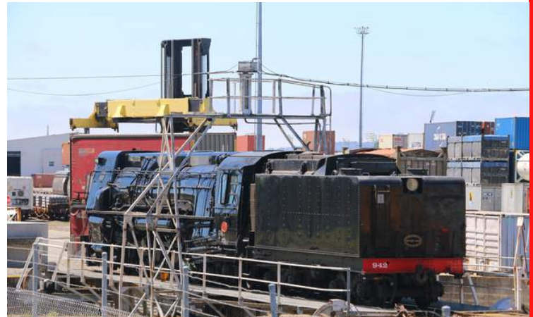
Being turned in Middleton.