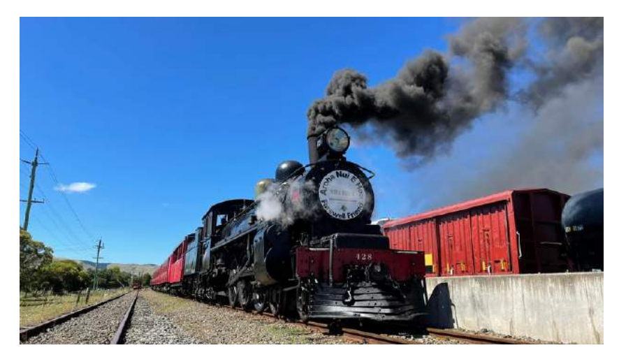
Weka Pass Railway.