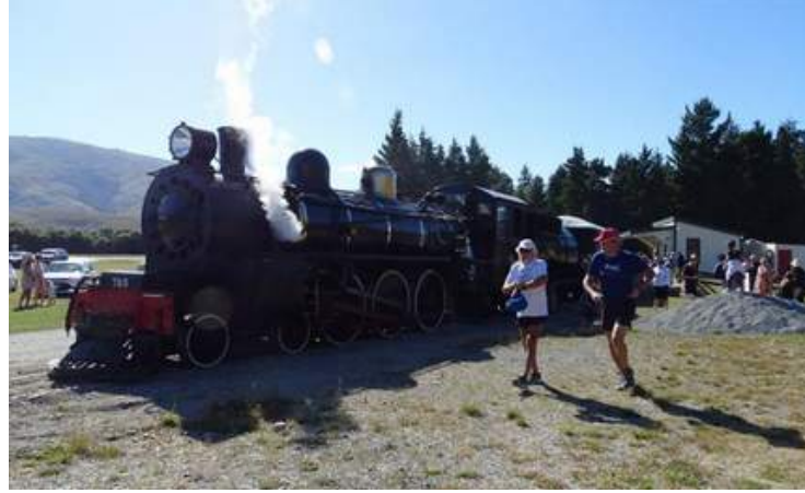
Photos: left- the train prepped for the big race. Neville Simpson; right: Cass Marrett