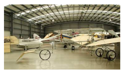
Croydon Aviation Heritage Centre.