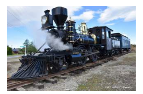
Waimea Plains Railway Trust.

For those that also want to join our tours of Invercargill area on Friday 3rd June and the Kingston Flyer, Lumsden Monday 6th June there will be a separate cost for these two tours of $70 each.