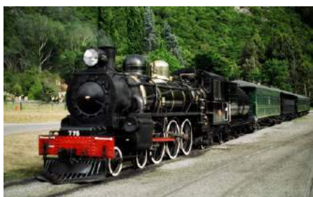
The Kingston Flyer.