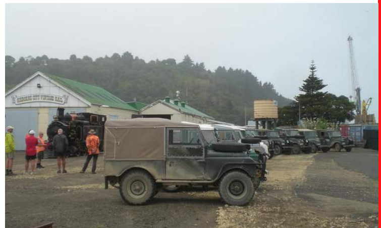
Left: Gisborne Station RAT Collection. Right: Land Rover Series 1 Enthusiasts Group at GCVR.