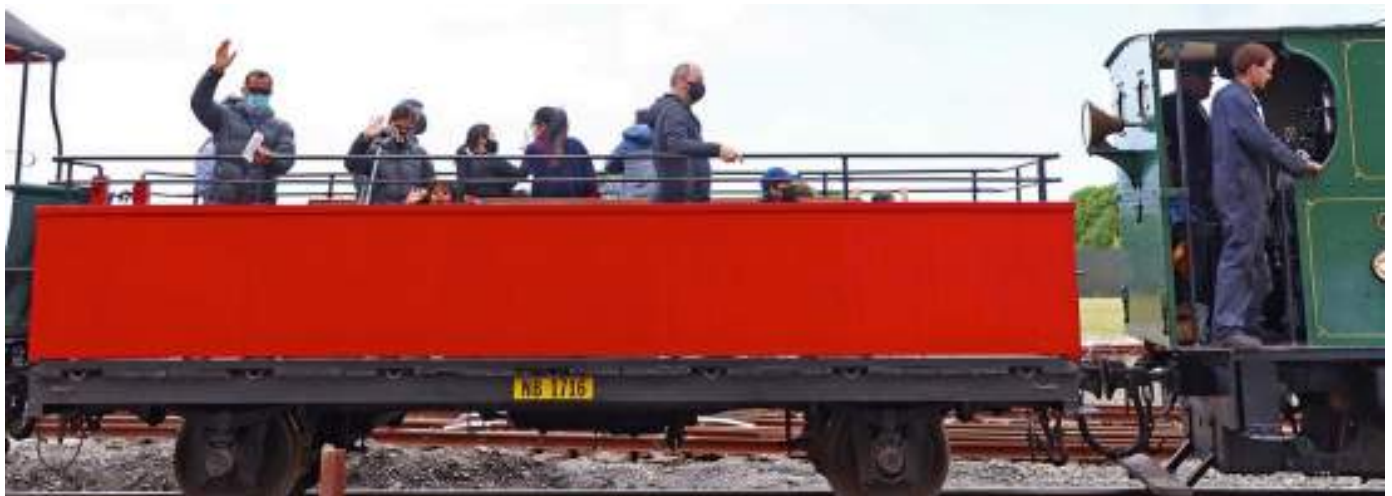
The new normal

Our monthly Coffee Chats are held from 10:30am on the second Friday of the month at The Brydone. Vaccine passports are required at The Brydone.