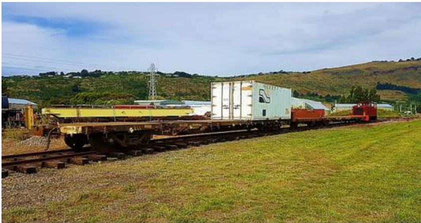
The latest three wagons safely on the rail. Uks136 with the TBC container, 4-wheel flat wagon Nak6283 and the NRM's Uk1413. The wagon numbers are their TMS numbers. 1st March 2022.

..Recently the Ferrymead Railway received three wagons from Dunedin Railways. These wagons are Uk1413, for the National Railway Museum, as well as Uks136 and Nak6283 for our Society. On the day they arrived at the Park we were able to move the TBC container off the Ub wagon it had been sitting on for over 12 years, and place it on Uks136. All three of the wagons require some TLC, but nothing too serious. This also applies to the Ub wagon, which will need a new steel deck and rust repairs. So another huge thank you; this time to the Rail Heritage Trust, Dunedin Railways and A&K Cranes, for helping us to save these wagons.