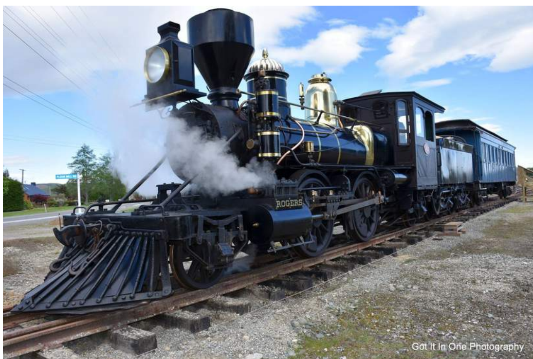
Waimea Plains Railway Trust.

For those that want to join our tours of the Invercargill area on Friday 3rd of June, and the Kingston Flyer and Lumsden Railway Station on Monday 6th of June there will be a seperate cost for these two tours- $70.00 each.