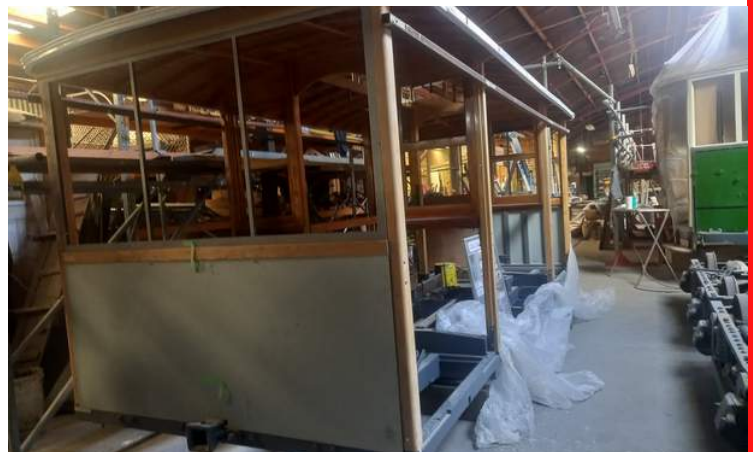
Left: The "Ä"end of Tram 24 showing current progress. Right: Progress is being made on Cable Car 103.