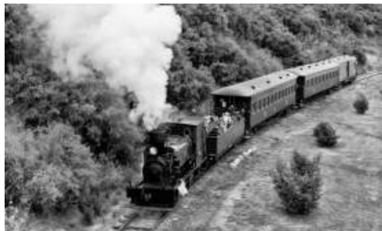
B10 running on Waitangi Day