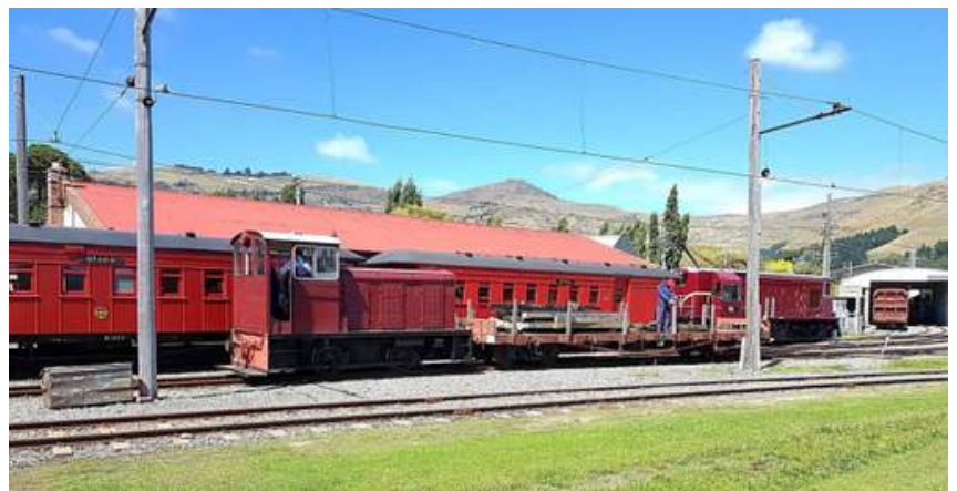
Tr111 shunting in the Moorhouse Yard as Di 1102 arrives at the station platform. 20th February 2022.