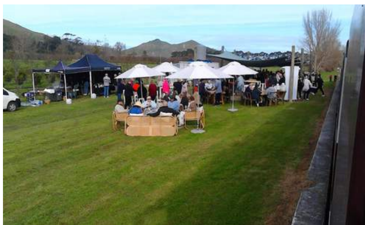
Left: Timber clamps. Right: Passengers enjoying the Chardonnay Affair.