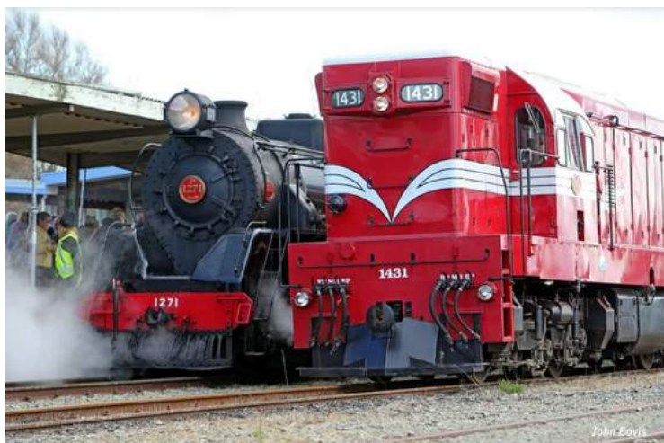
Left: Upper Hutt dock crossing. Right: Woodville.