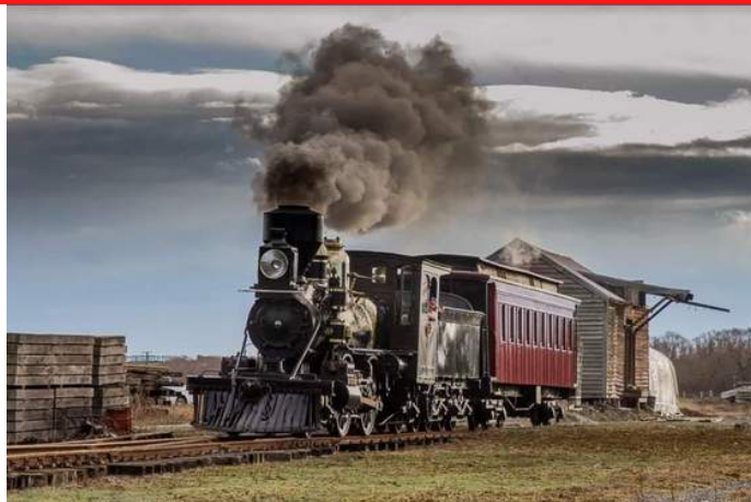
K92 & A294 at Waimea Plains Railway.