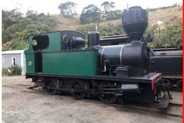
Left: Passengers enjoy the new awning outside the PJ café. Right: The Peckett looking very clean with the Cb behind it at the recent open day.