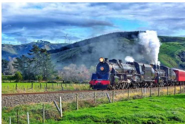
Left: the trains depart in tandem from Wellington. Right: just out of Woodville.