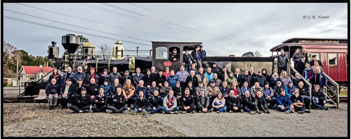
FRONZ INVERCARGILL CONFERENCE 2022 GROUP with K 92 @ MANDEVILLE

The official group photo.