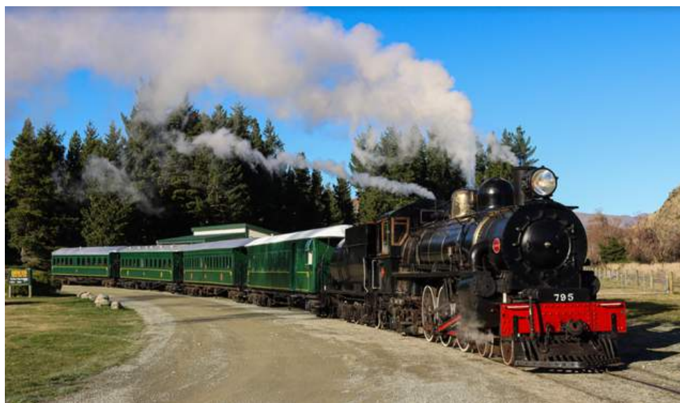
AB795 heading the Kingston Flyer. Left- at Kingston. Right- at Fairlight.