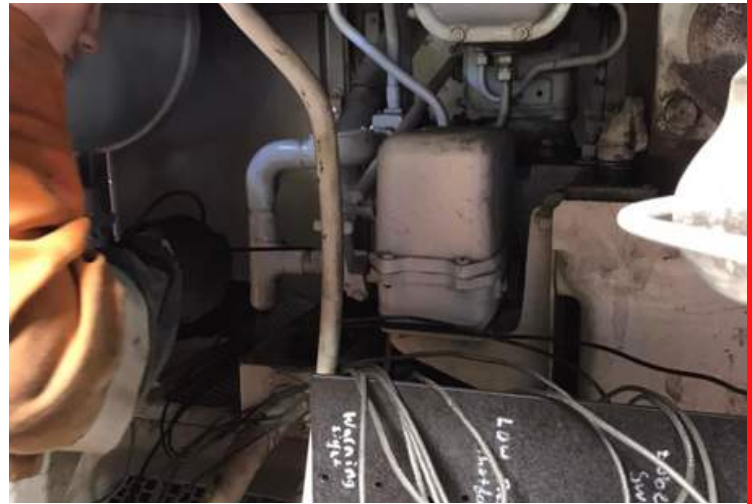
Left: Sight glass in place in radiator room. Right: New wiring being run for pressure switches.