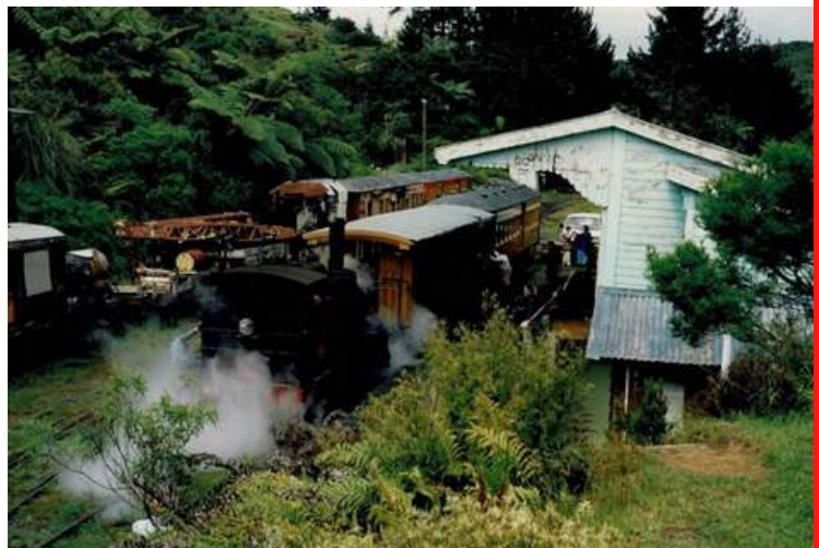
Left: Tr459 is lowered by crane onto the BTC track Right: & Pukemiro Junction station scene around 1980, found in a drawer