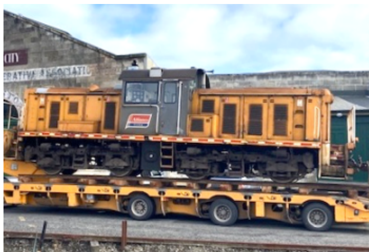
Left: Oamaru TODAY, right: Oamaru Steam and Rail Digest