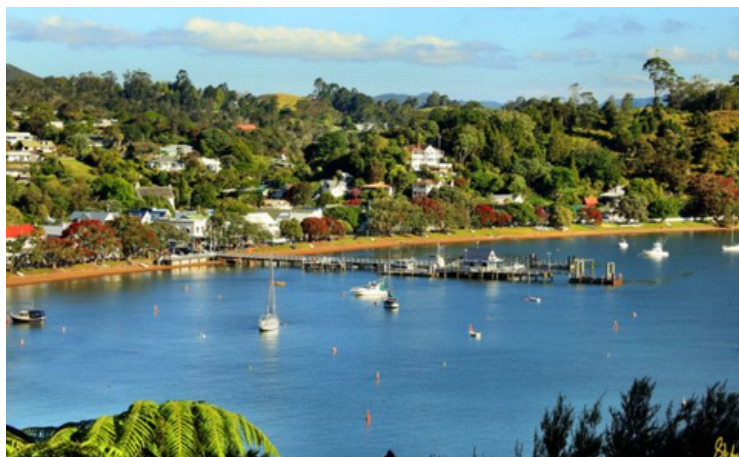
Left: Hokianga Harbour Right: Russell