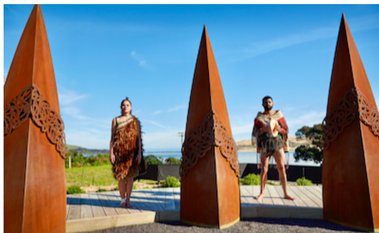
Photos: Left: Tane Mahuta Walk - doc.govt.nz Right: Manea - Footprints Of Kupe - aa.co.nz