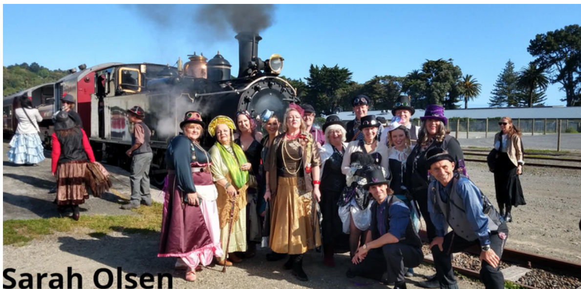
The Steampunk group.