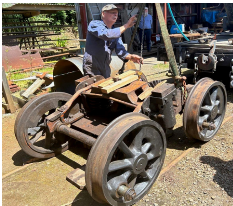
Left: Members enjoy the December "nosh up".