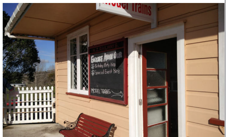
Photos: Left: Whangarei Railway Station - nzherald.co.nz. Right - Whangarei Steam and Model Railway Club - steamnorth.co.nz