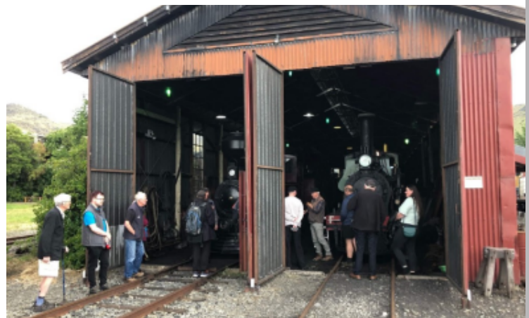
Left: all assembled at the Moorhouse Signal Box. Right: Looking through the Steam Loco shed.