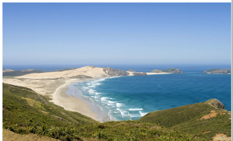
Photos: Left: Cape Reinga - doc.govt.nz . Right: Ninety Mile Beach - worldbeachguide.com