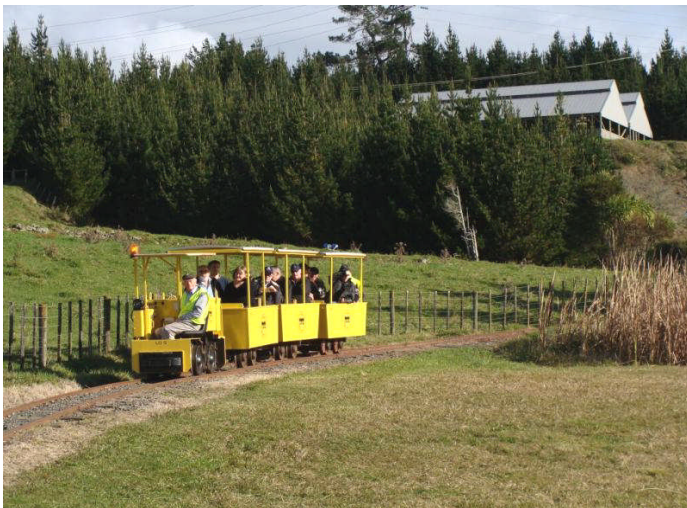
VICTORIA BATTERY TRAMWAY VISIT Waikino : 30 May 2008 : Photo : Nigel Hogg