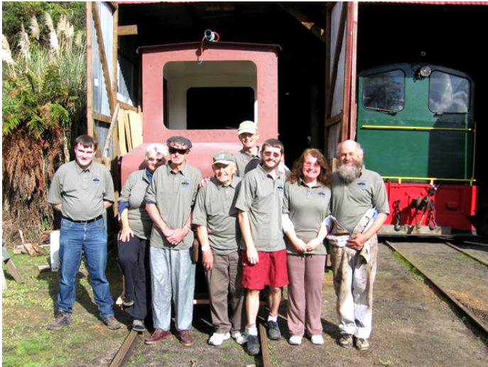
OUR BUSH TRAMWAY CLUB HOSTS Pukemiro : 1 June 2008