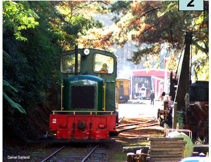
OUR BUSH TRAMWAY CLUB VISIT Pukemiro : 1 June 2008