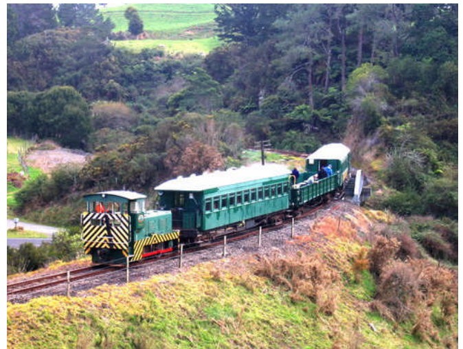
GOLDFIELDS RAILWAY VISIT FRONZ Special crosses SH2.