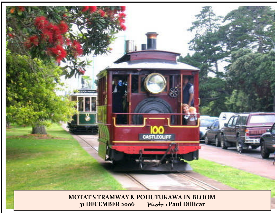
MOTAT'S TRAMWAY & POHUTUKAWA IN BLOOM 31 DECEMBER 2006

THE NEXT ISSUE OF 'JOURNAL' WILL BE PUBLISHED IN FEBRUARY