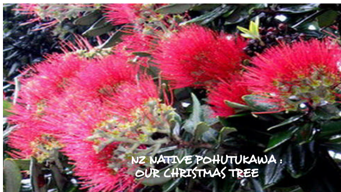
NZ NATIVE POHUTUKAWA : OUR CHRISTMAS TREE

The Team at FRONZ wishes you and your Team a Joyful and Happy Christmas & a Healthy & Safe 2009