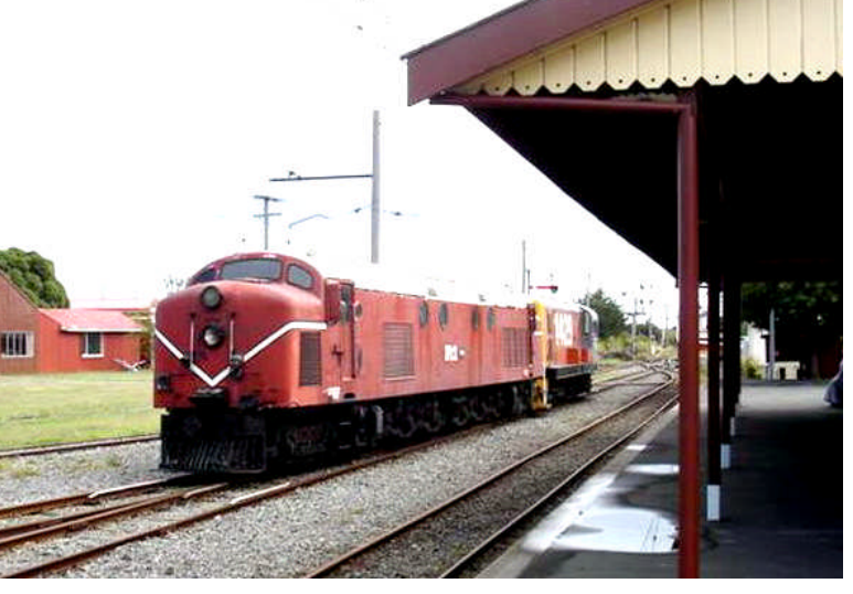
ARRIVING AT FERRYMEAD; 28 JANUARY; PHOTO: NEV TOBIN