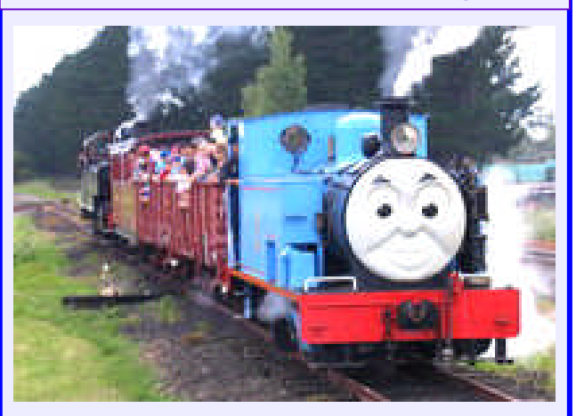
Mainline Steam's Hudswell Clark at a GVR "Thomas" event in November 2007

STOP PRESS: see later in this issue !!! (page