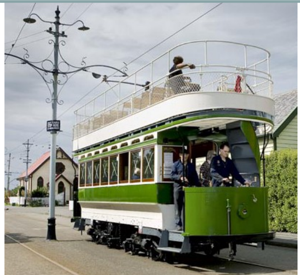
Just some sign-writing and minor adjustments to finish, and Tramway Historical Society members can proudly recommission former CTB Double Decker Tram # 26 on Saturday 23 rd January.