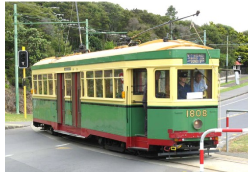
Your eyes don't deceive you ! It is former Sydney Tram # 1808 now running on MOTAT's Western Springs Tramway in Auckland. 29 December 2009.

Once again, we are indebted to Rural Women NZ for help in compiling this round-up of recent “Government Bumpf”